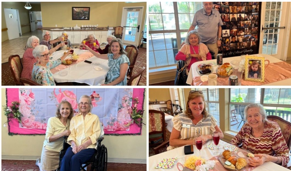
Our Mother's Day Tea Party was a success.