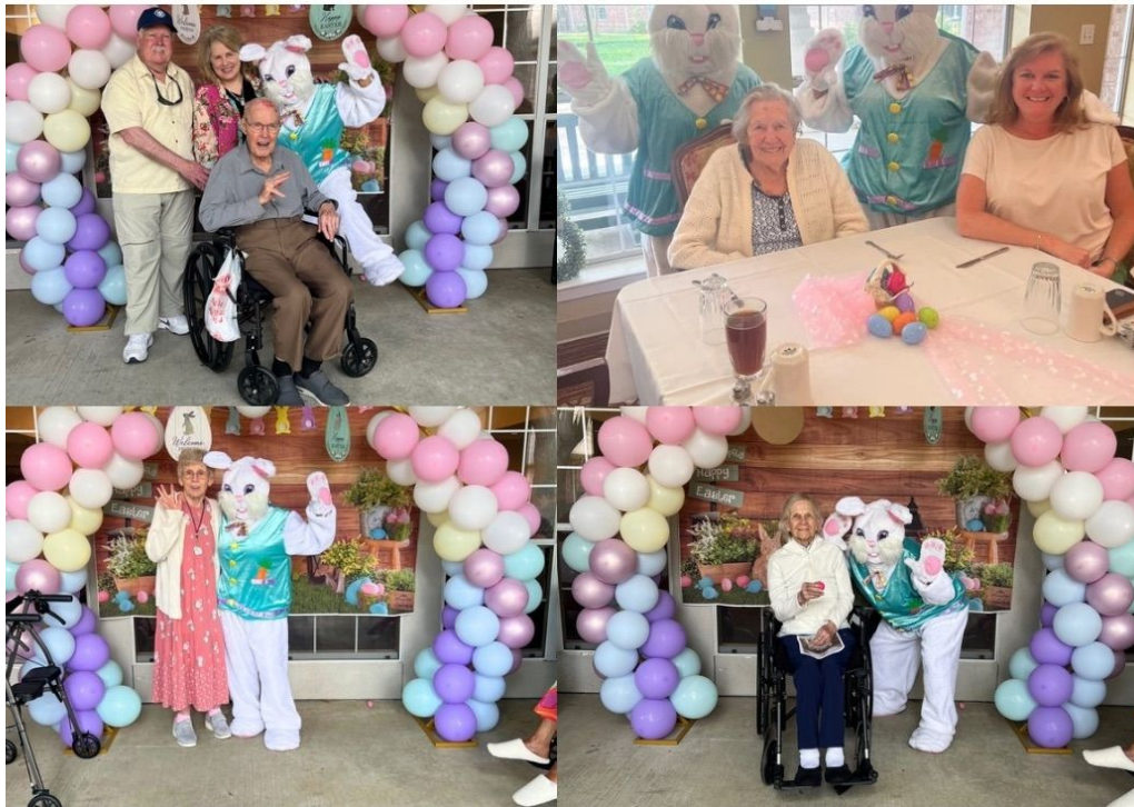
Residents had a blast during Easter Day